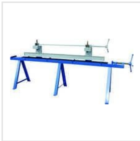
Plywood Finger Jointing Machines