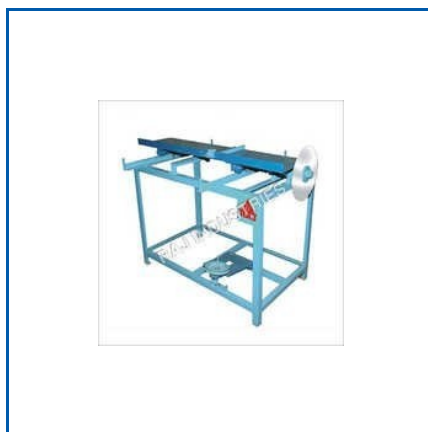
PLYWOOD MAKING CIRCULAR TABLE