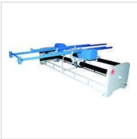
Plywood DD Saw Machines