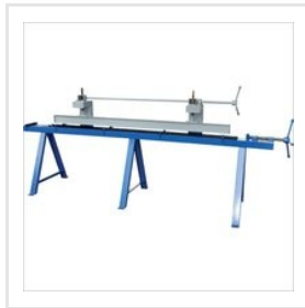
Manual Finger Jointing Machines