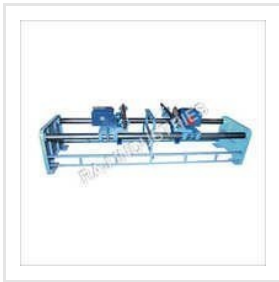
DD Saw Machine