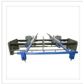
Industrial DD Saw Machine