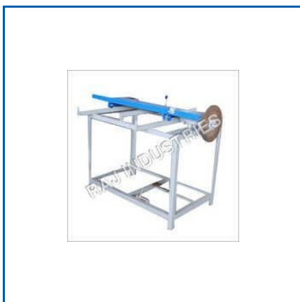
CIRCULAR SAW TROLLEY

Automatic Dd Saw Machines, Circular Saw Table, Circular Saw Trolley, DD Saw Machine, Finger Forming Machine, Finger Jointing Machine, Glue Mixer, Glue Spreader Machine, Heavy Duty Dd Saw Machines, Hydraulic Finger Joint Machines, Industrial DD Saw Machine, Industrial Plywood Machine, Manual Finger Forming Machine, Manual Finger Jointing Machines, Pedal Chopper, etc.