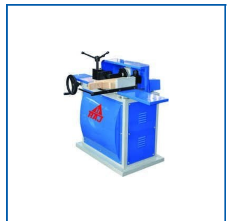
PLYWOOD FINGER FORMING MACHINE