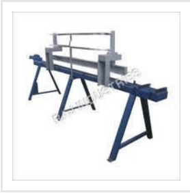
Finger Jointing Machine