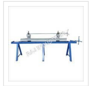
Wood Finger Joint Machines