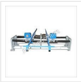
Heavy Duty Dd Saw Machines