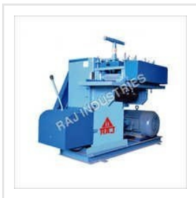
Rip Saw Machine