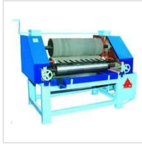
Glue Spreader Machine