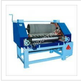
Plywood Glue Spreader Machine