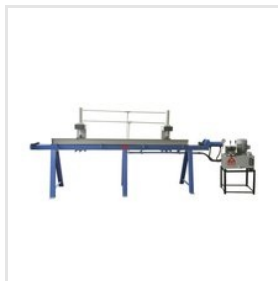
Hydraulic Finger Joint Machines