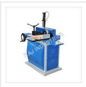
Finger Forming Machine