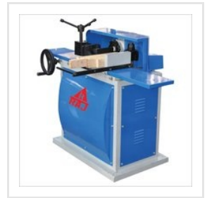
Manual Finger Forming Machine